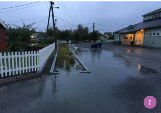
1 Extreme rains stress testing the recently installed raingardens.

Storm water management project in Sogn Allotment Garden, Oslo, Norway