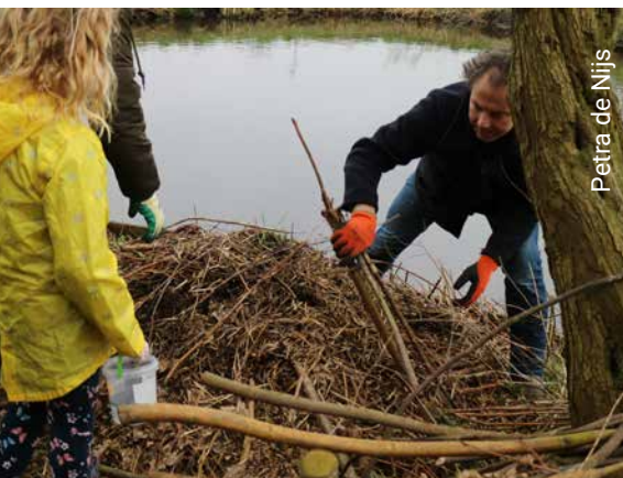
Making a heap for grass snakes