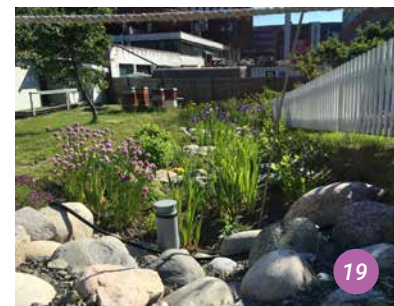
20 The terrace rain garden is constructed to test out a multi-level rain garden