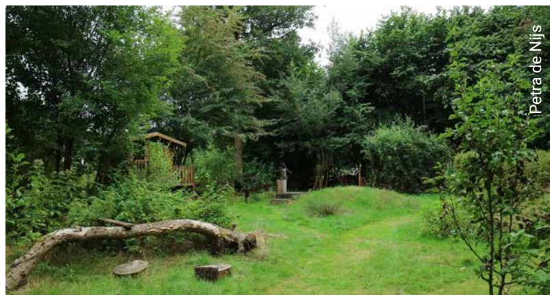
Petra de Nijs

In 2020, a year in which we all dealt with the restrictions regarding covid-19, the garden park turned out to