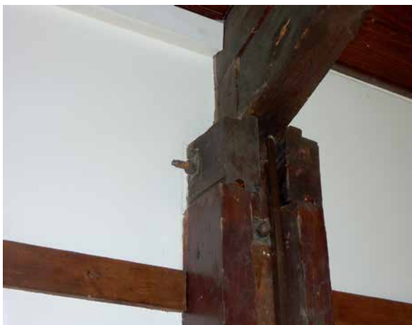
Clubhouse - wood details