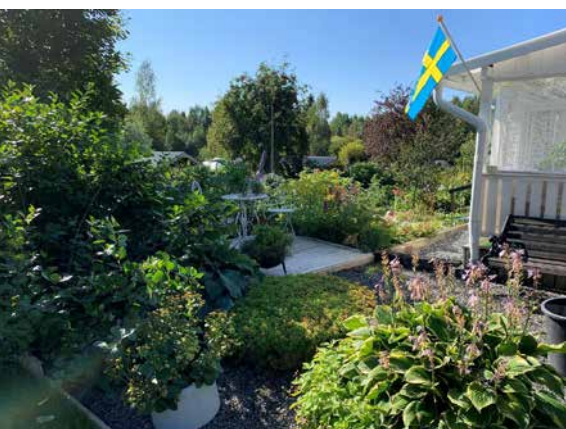
Planting a tree is the best thing you can do in your garden to promote biodiversity.

Creating an arboretum, a unique initiative in the North of Sweden