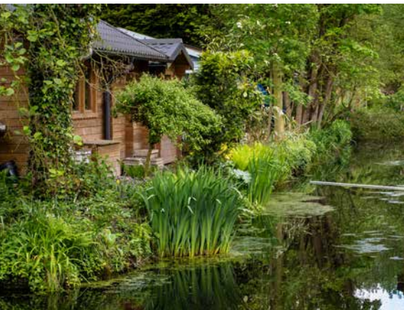
Lush bank vegetation

paths, a pond, a herb and scent garden, spacious flower beds, various fruit trees, overgrown stone walls and a wild life hedge. “De Wijde Blick” has a lot of food sources for any animal that flies or crawls.