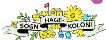
3 Sogn Hagekoloni (Sogn allotment garden)