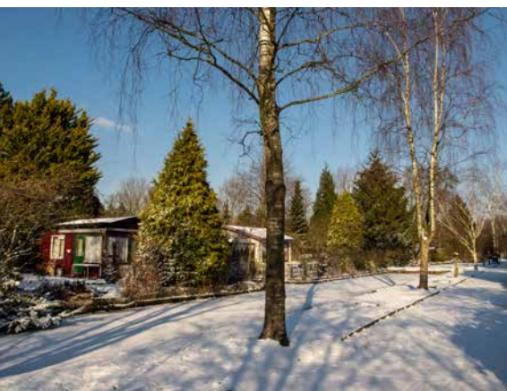
Snowy paths and sides