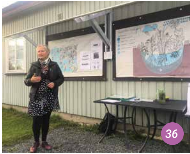
36 Lecturing on the principles of the rain garden structure