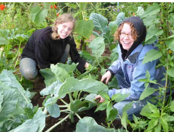
Students of Lüneburg University in a permaculture garden

Former president of the National Allotment Federation of Lower Saxony