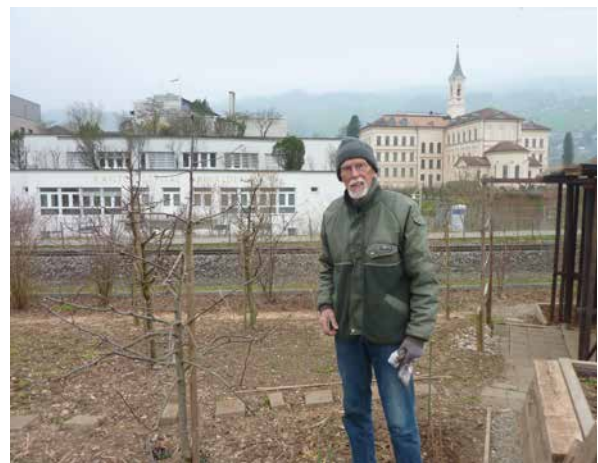
Expert in fruit cultures