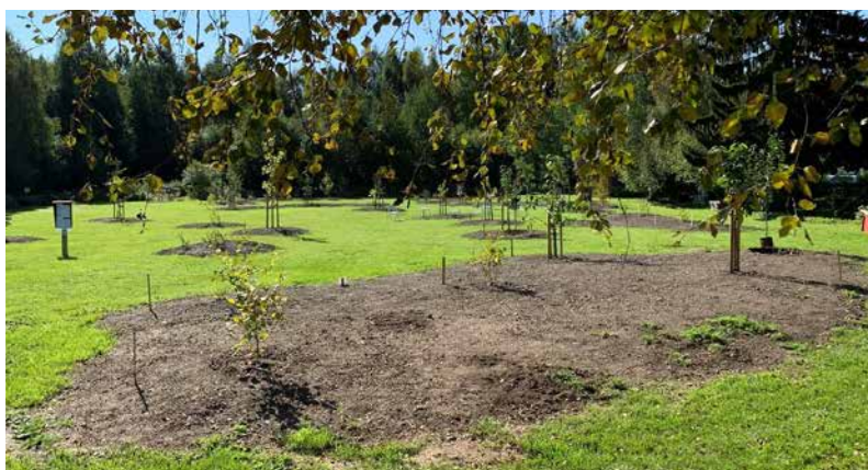
The other two lawns have been transformed to meadows, which also benefit biodiversity.

To finance the project they also applied and were granted a loan for 10 000 euro in 2020 from the Allotment Federation's "Loan Fund", from where member associations can ap-