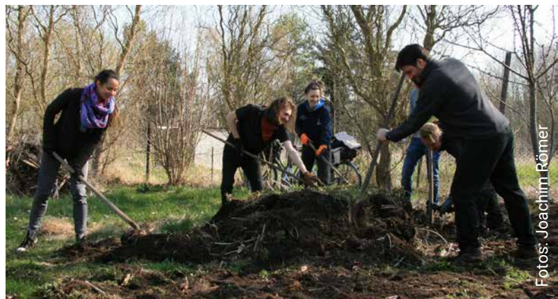
„Garden of the future“ in the allotment site „Moorfeld“ in Lüneburg