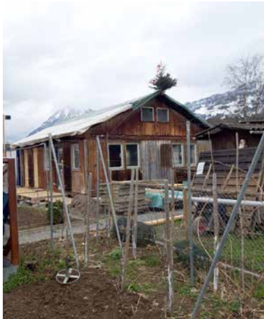
Topping-out ceremony of the clubhouse

The cultivation is rigorously oriented towards natural practices, and thanks to long-standing members, a platform of experience is also available to show new tenants for ways of achieving decent yields without chemicals, not only for vegetables and berries, but also for fruit cultivation.