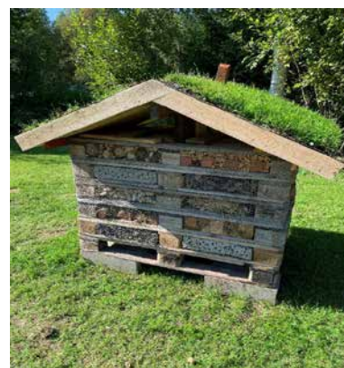
Bee hotel in the arboretum.

The allotment site Dalkarlsliden received the International Federation's diploma for innovative projects.