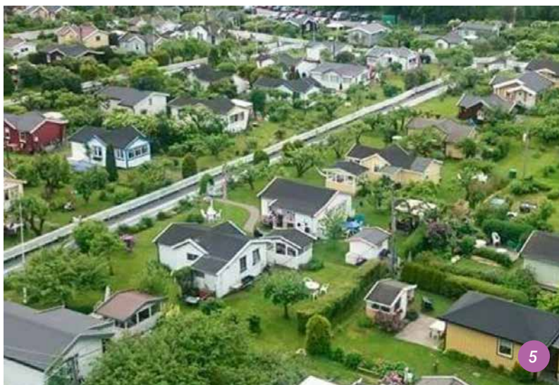
5 Partial view of Sogn Hagekoloni