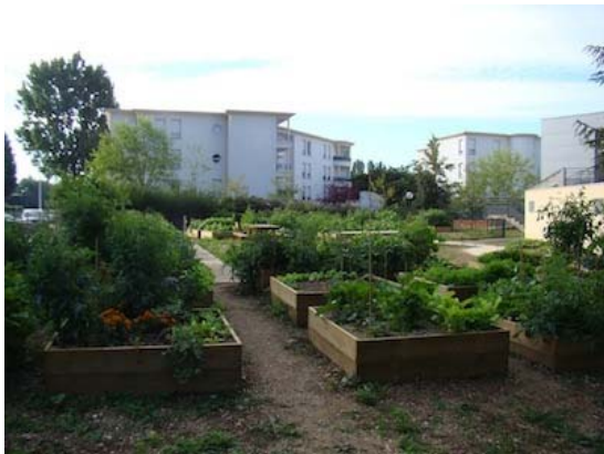
View from the site entrance