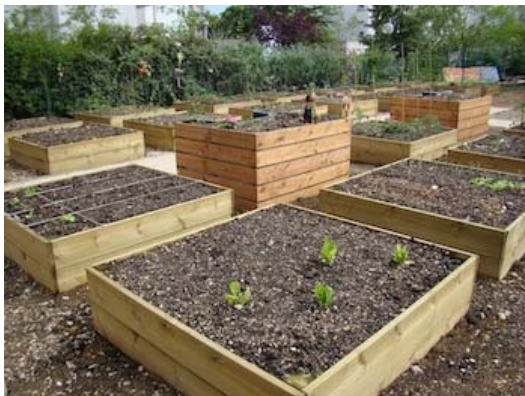
The growing planters