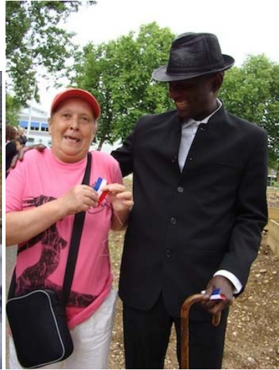
The happiness of the new gardeners