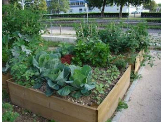
The vegetables are marvellous