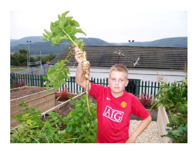
By making the allotment area much easier to work in the young people showed much more interest in the project and really took ownership of it.

The Vegetables were and still are cooked by the young people in the centre for the young people of the centre ensuring that all the young people who use the centre get to eat healthy home grown produce.