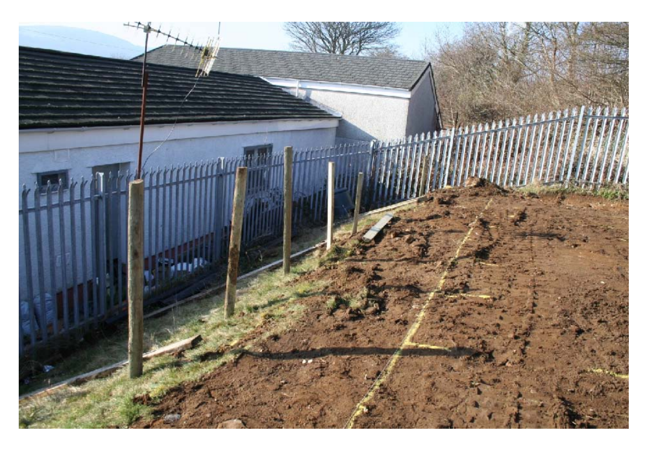
So the site was cleared and timber raised beds were erected making planting a joy for the young people and weeding a doddle.