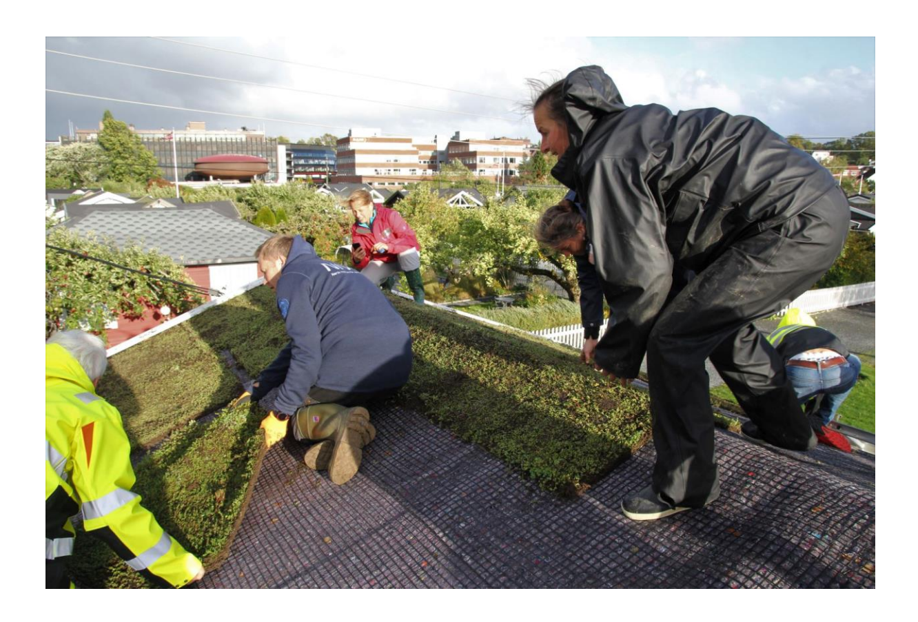
The allotment association "Steffens Minne" in Karlstad (SE) received the diploma for innovative projects

The association "Steffens Mine" has worked actively for the past few years with a number of interesting, innovative and environmentally friendly projects, several of which have had biodiversity in focus.